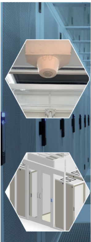
Sensor Controlled Lighting